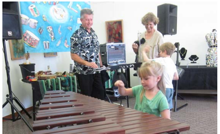
ACWL Programs are supported by our membership!

EVERYONE'S FAVORITE STORE IN THE WHITE LAKE AREA